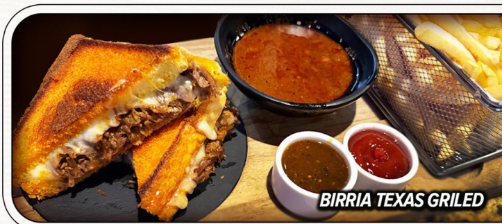
BIRRIA TEXAS GRILED

* COOKED TO ORDER. CONSUMING RAW OR UNDERCOOKED MEATS, POULTRY, SEAFOOD, SHELLFISH OR EGGS MAY INCREASE YOUR RISK FOR FOOD-BORNE ILLNESS