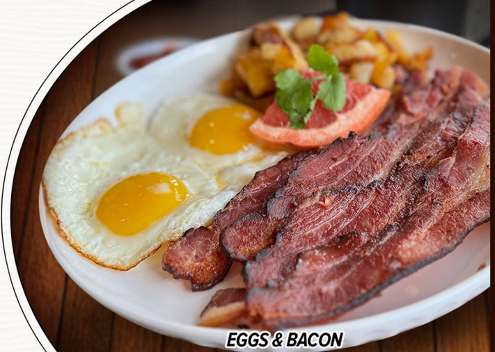
EGGS & BACON