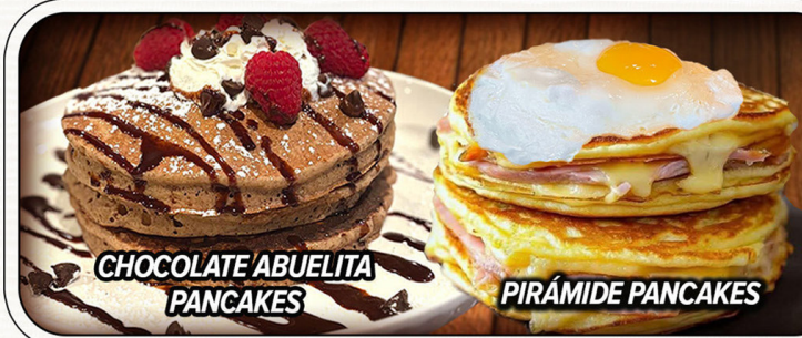
CHOCOLATE ABUELITA PANCAKES