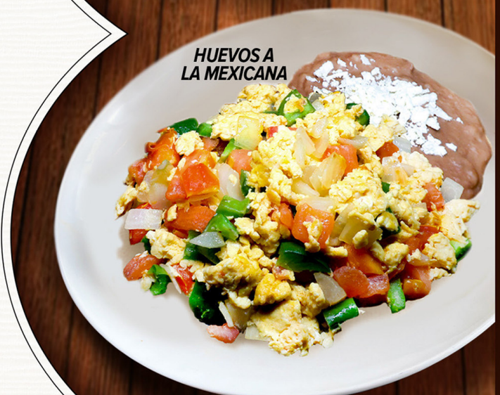
HUEVOS A LA MEXICANA